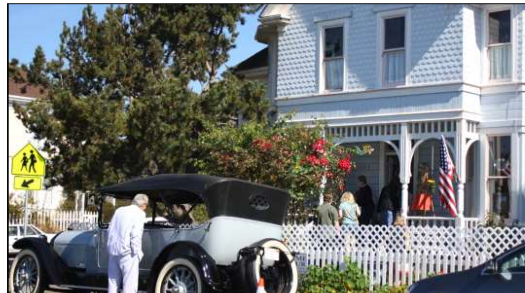
Home-tour-goers take in the sights at this year’s popular event in October.

And at one house, a toddler loudly proclaimed to her father: “This one is the most beautiful-er.”