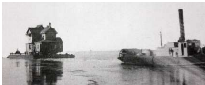
Humboldt County Historical Society