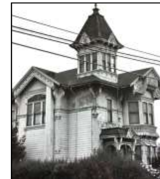
The Buhne Mansion (left) and the Huntoon House were demolished in the 1950s.