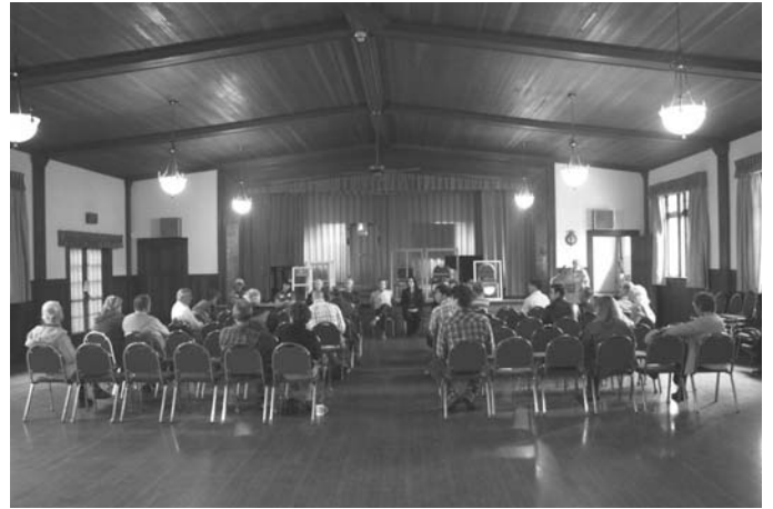
Original windows in Woman’s Club historic building

The event brought together window experts and entrepreneurs to discuss and debate when it is best to repair and maintain original windows in historical buildings and when modern replacements may be a better choice.