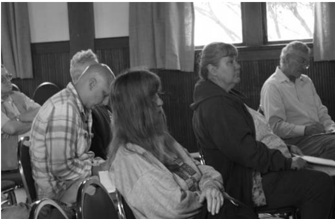
Better to repair or replace original windows?