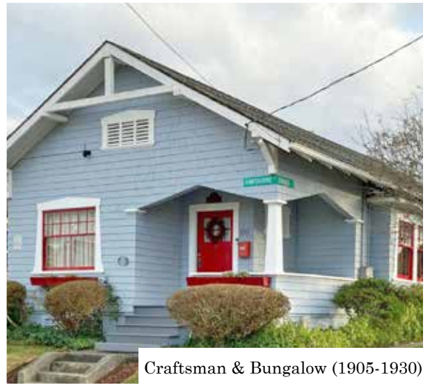
Craftsman & Bungalow (1905-1930)