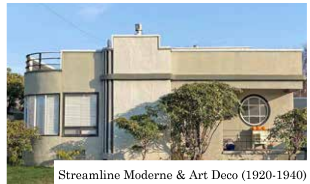
Streamline Moderne & Art Deco (1920-1940)