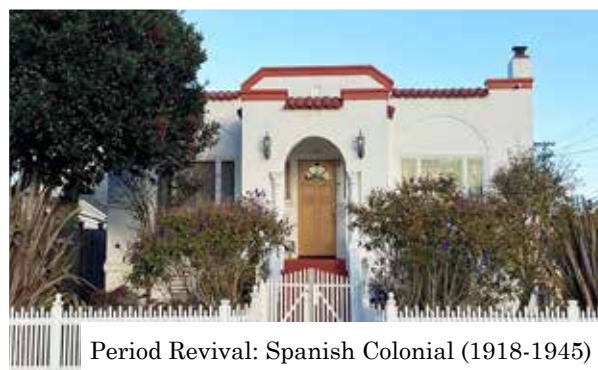
Period Revival: Spanish Colonial (1918-1945)