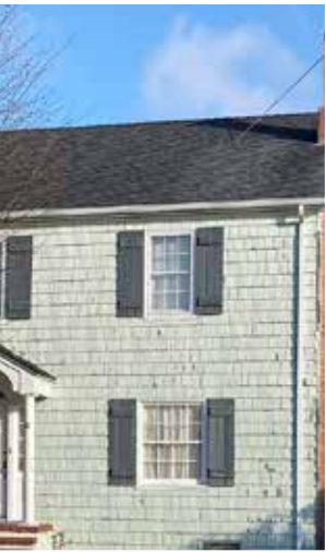
Colonial Revival (1900-1950)

ces that evolved se smaller, wor- e ideal for a small,