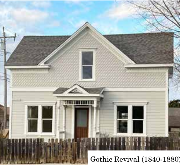
Gothic Revival (1840-1880)