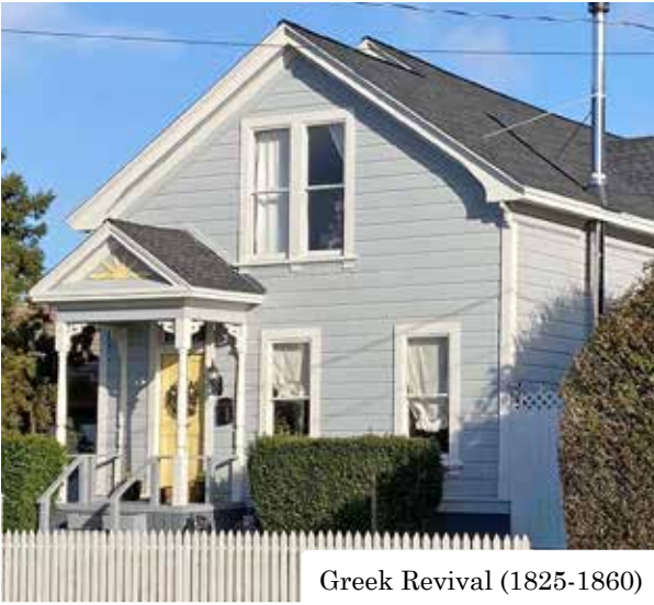
Greek Revival (1825-1860)