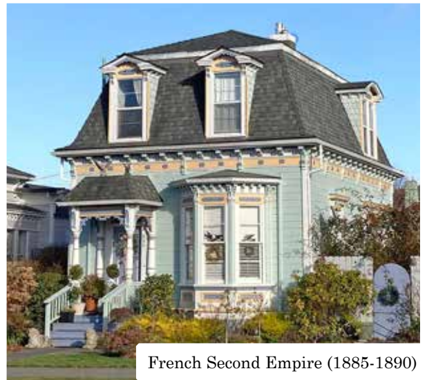
French Second Empire (1885-1890)