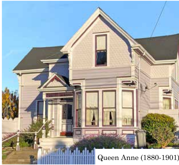
Queen Anne (1880-1901)