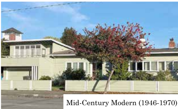
Mid-Century Modern (1946-1970)