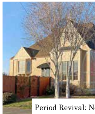
Period Revival: N