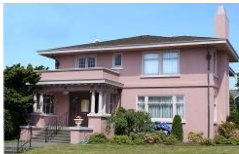
Holland home — 2333 E Street