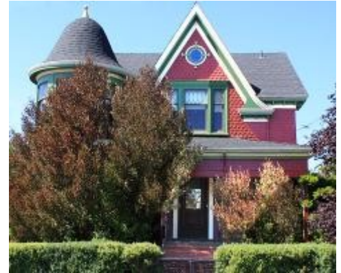
Stokey home — 303 Wabash Avenue