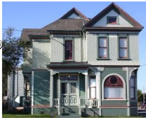
Debacker home — 904 M Street

HOLIDAY PARTY Ingomar Club Saturday, December 17 11:15 a.m. – 2:30 p.m.