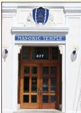
Masonic Hall — 517 G Street