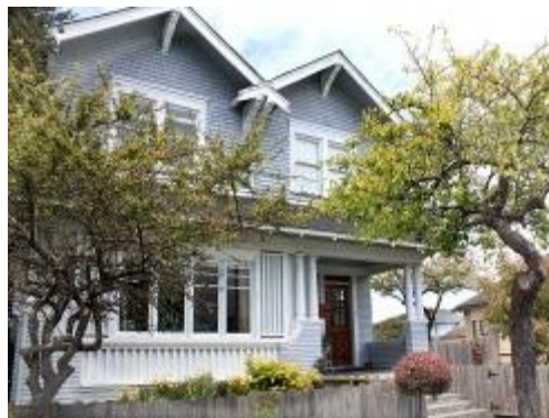
Lancaster home — 241 15th Street