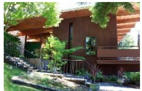
Wolford home — 139 St. Francis Court