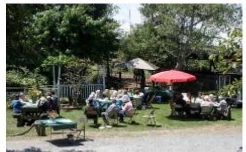
A rare sunny day for box lunches on the lawn